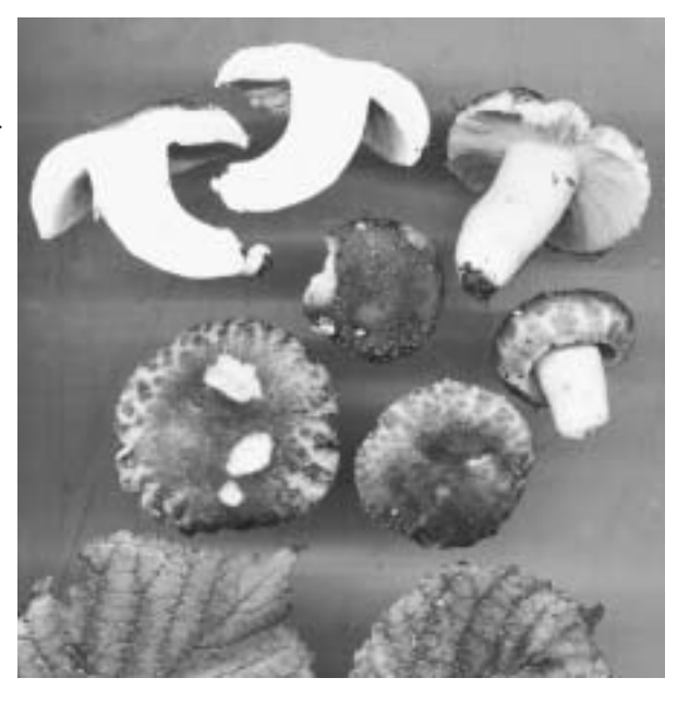
Above: Russula pseudo-affinis – Veiled Brittlegill. New To Britain – recorded form Golders Hill Park in 2003

They can be difficult to identify without microscopic work, though some are easy enough in the field. 36 species have been recorded so far from Hampstead Heath, 1 species new to Britain and some new records for the county of Middlesex.