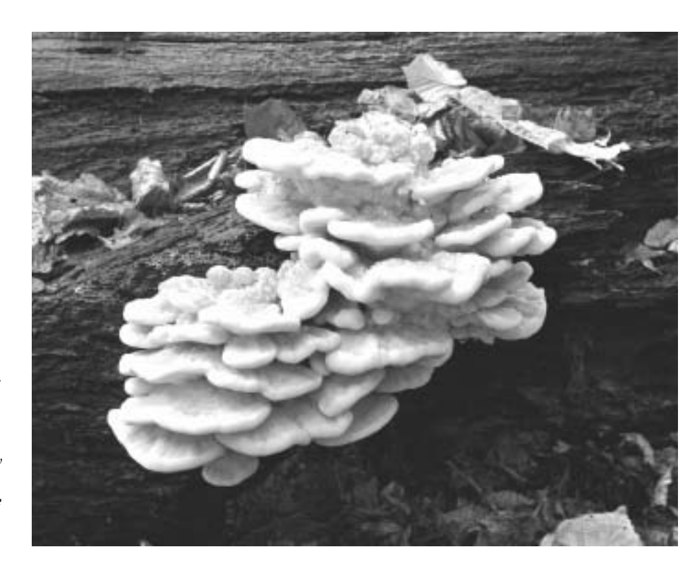
Right: Laetiporus sulphureus -'Chicken of the woods'

The state of our woodlands and grasslands rely on the presence of fungi, without fungi, trees & other vascular plants would be weak & a lot less healthy, without fungi our world would resemble a refuse tip, without fungi hundreds of insect species would perish, without fungi the autumn would be a less colourful and inspiring time of year. The message is simple, conserve our natural habitats and we conserve the fungi therein.