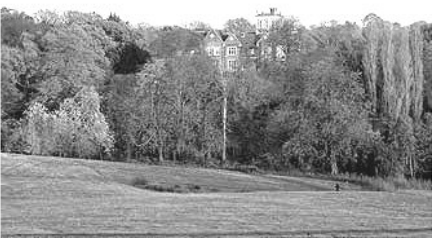
Another view from Cohen's Fields

agreement requiring the restoration of the mansion and cottages. If any applications are submitted to demolish and replace the mansion, these should immediately be sent back. Instead, Camden must ensure that all the obligations of their existing and excellent agreement are fully implemented and complied with. We, and other organisations in the area, will give them every support to ensure this is fulfilled.