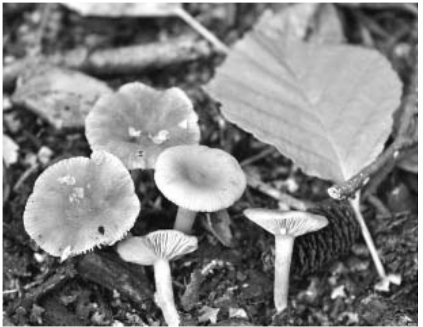
Above: Lactarius obscuratus 1st record for Middlesex – West Meadow-North Copse-Kenwood Estate