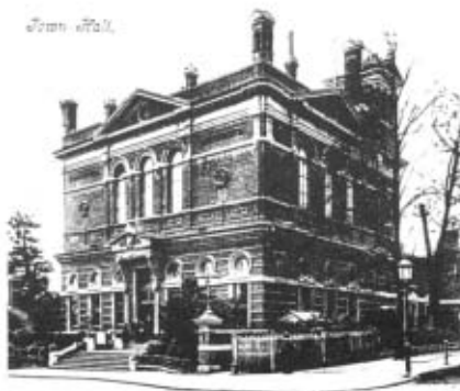
An old print of the Town Hall

Community activities of just the sort we all hoped for are now flourishing there (for example the film club and the choir), and of course U3A itself offers a wide range of opportunities, both educational and social.