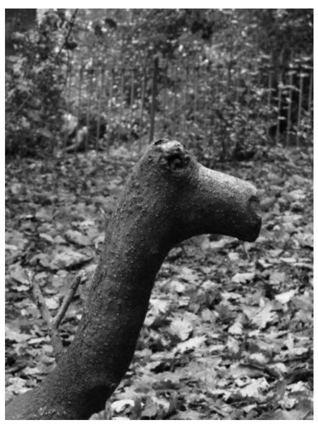
A "baby diplodocus"

The Heathlife project is at: www.heathlife.co.uk