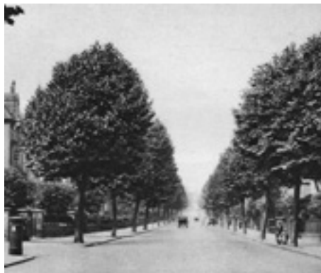
Fitzjohn's Avenue a century ago