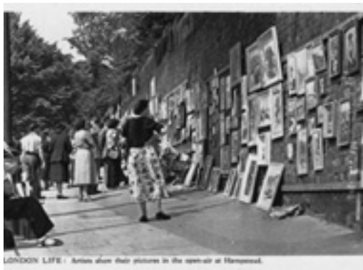
The Open Air Art Exhibition in the 1950s